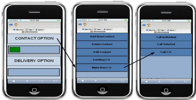
Figure 1. Group application with working functional components

The development of general mobile application that covers the many features for MCL can resolve the deep desire of students to make possible collaboration with mobile anytime and anywhere. Therefore our pre-usability testing gives the complete picture for developing the mobile application that will help the students to get the requested contents from server to fulfill the course requirements. We focus to develop application "group" with support of SDK and Visual basic and running on android operating system (OS) shown in figure 1 with other working functional components, which consists of control option and delivery option. The control option performs the functionalities of add new contact, edit contact, delete contact, existing collaborative group (C-G) and make new C-G. Delivery option covers the function of receive and send. When user requests for contents from server side, uses delivery option and saves with help of store component.