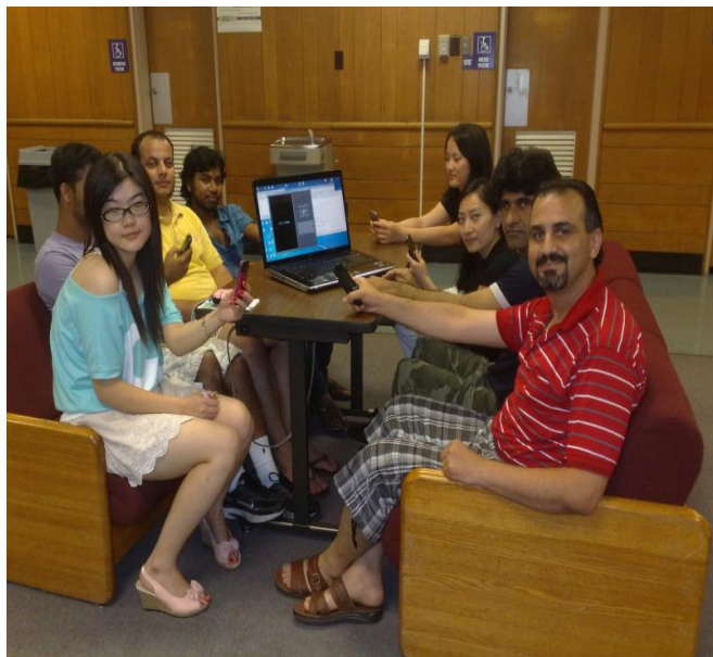
Figure 4. Testing process of some features of group applications

After completion of questionnaire, we arrange the meeting in which all the participants come and share their experience and give their impression regarding the test. We also get suggestions regarding the redesign and modification of application. When participants leave the room, we compile the results and arrange in form of table for better understanding shown in table 2.